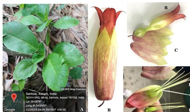
Figure 2A. Kalanchoe pinnata (Lam.) Pers. (Crassulaceae) in the natural habitat and its morphological characters. B. Individual flower with tubular corolla exposed after removing calyx; C. Tubular Calyx removed from tubular corolla; D. Stamens with anthers exposed from tubular corolla; E. Carpels with ovary at base.

Da Silva et al (1995) used BALB/c mice for the experiment and Leishmania amazonensis (lma) was used to induce the disease, the work demonstrate that the aqueous extract of plant protects mice against progressive infection with lma by oral route of administration. Muzitano et al (2006) studied about the antileishmanial activity of few unusual flavonoids from K. pinnata . The three flavonoids were tested separately against Leishmania amazonensis amastigotes in comparison with quercitrin, quercetin and afzelin. The quercetin aglycone – type structure, as well as a rhamnosyl unit linked at C-3, seem to be important for antileishmanial activity (Muzitano et al., 2006). Various studies have been undertaken to investigate the potential of K. pinnata extract as an immunomodulatory agent. In one such study, the immunomodulatory activity of the ethanolic extract of K. pinnata leaves in rats. The study found that the extract significantly increased phagocytic activity, lymphocyte proliferation, and delayed-type hypersensitivity response, indicating its potential as an immunomodulatory agent (Elufioye et al., 2022). Another study investigated the immunomodulatory activity of the aqueous extract of K. pinnata leaves in mice. The extract significantly increased